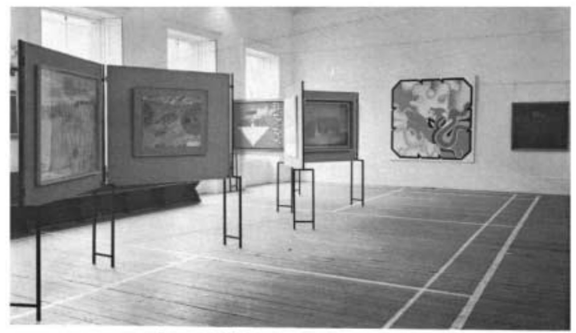
Contemporary Inih Paintings Exhibition, Y.M.C.A. Hall, Wendowl