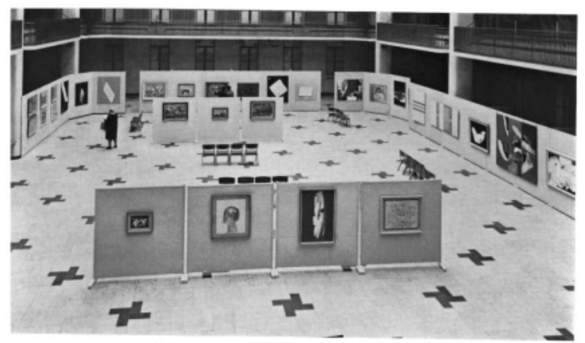
Modern Irish Painting Exhibition, Frederiksberg Rådhus, Copenhagen