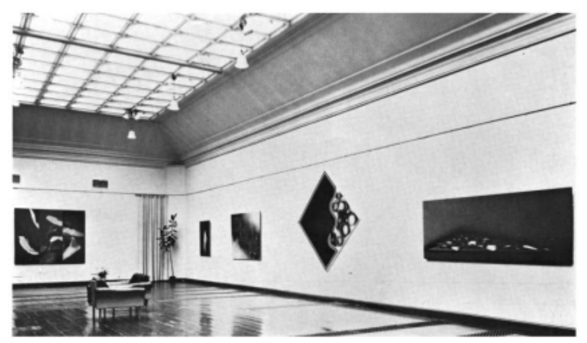
Modern Irish Painting Exhibition, Art Museum of Ateneum, Helsinki