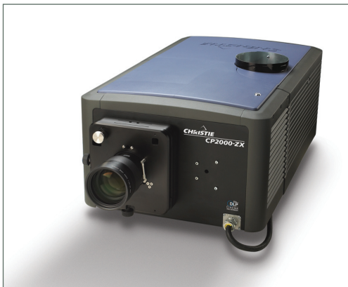
Christie CP2 000-ZX

Christie's CP2000-ZX is described as an all-in-one "compact and cost-effective digital cinema projector" designed for small to mid-sized screens. It is suitable for screens up to 45ft (14 metres) in width. Unlike its larger stablemate, the popular CP2000, the new projector requires single-phase power making it more suitable for a wider range of venues. 10