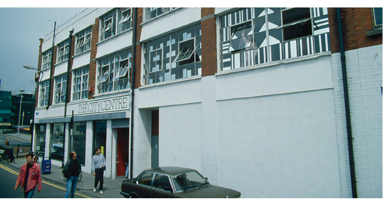
City Arts Centre, Moss Street, Dublin

Dreams are important, both personally and collectively. As Grapevine progressed, we spent a lot of time analysing and building our mission. Perhaps it was our - predominantly working-class – background that made us so concerned with validating our work and legitimising our dream. We lacked confidence because the arts were not supposed to be for the likes of us. Traditionally, 'arts people' did not question their right or justification for what they did. There was a sense of entitlement. But over the coming years, particularly when we became aware of the community arts movement in the UK, we felt not only that our work was legitimate, but we began to interrogate the role and purpose of the arts in society. It is to the Arts Council's credit that they joined us on that journey.