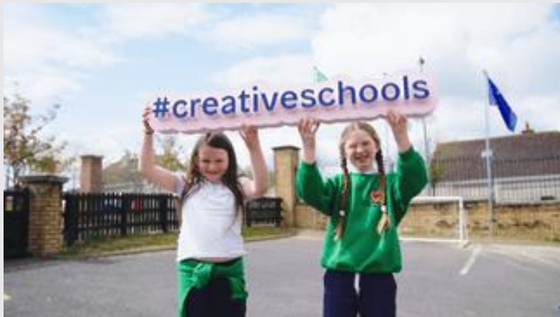
Gaelscoil Na Loachra

Supports schools to put the arts and creativity at the heart of children's and young people's lives.