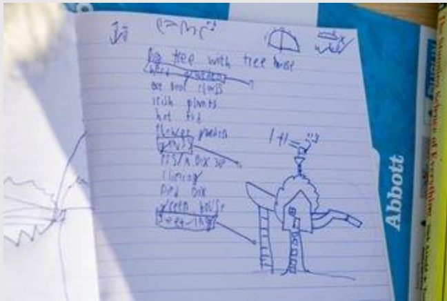
Drumcondra Parish School

Empowers children and young people to develop, implement and evaluate arts and creative activity throughout their schools.