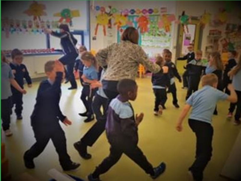
Holy Family Junior School